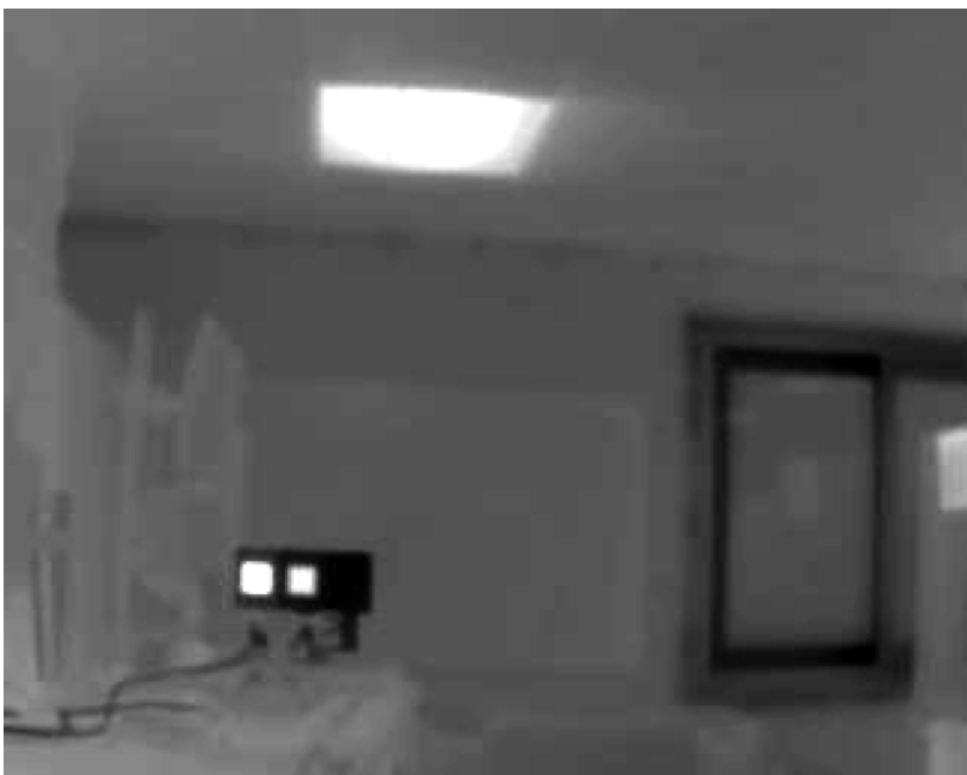
Figure 7. VOX after Shutter Correction