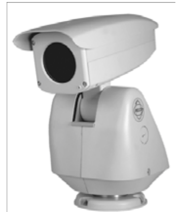
Figure 1. Pan/Tilt Thermal Security Camera

Figure 3 shows a thermal camera that has had 45 consecutive days of solar exposure without any correction being applied. Similar effects are seen for both VOX and \alpha -Si cameras (this particular example is for the \alpha -Si camera). Figure 4 shows the resulting image quality obtained after correction based on a single shutter operation is applied. The image in Figure 4 is stretched to maximum contrast and shows no residual streaks remain after applying the correction algorithm.