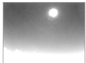
Figure 4. Image after Correction Applied