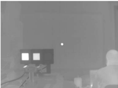
Figure 9. Image 2350°C with NUC but without Sun Exposure Algorithm

Using the α-Si camera, this experiment is a set of 100 images of a scene with blackbodies (with non-uniformity applied, but no sun compensation) taken over a 26 second time period. The median spot value for was calculated for the first and last image and the temporal noise of the spot and the back-ground was calculated. Figure 9 is one of the 100 images.