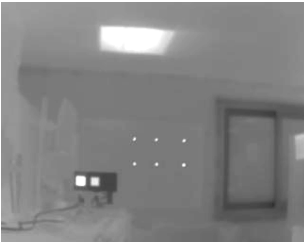
Figure 6. VOX Camera after 2200°C and 2500°C Exposures before Correction