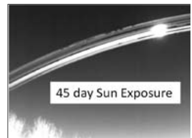
Figure 3. Uncorrected Image