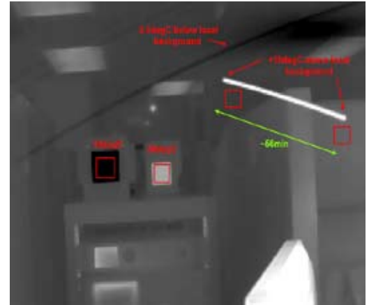
Figure 5. Effects of Two Sun Exposures on a VOX Camera

The white streak in Figure 5 corresponds to a second sun exposed area without any correction being applied. Using the blackbodies in the scene for calibration, it is possible to convert the sun impression into an equivalent change in degrees Celsius. In this case, the intensity of the uncorrected, sun imprinted white streak corresponds to a 19°C temperature difference.