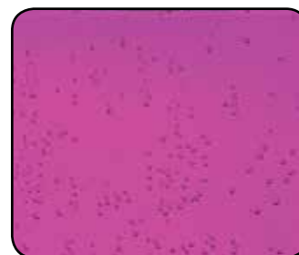
PURPLE/PINK for fully formulated ethylene glycol-based coolant