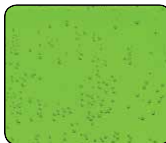
GREEN for conventional low-silicate coolant