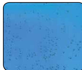
BLUE for fully-formulated propylene glycol