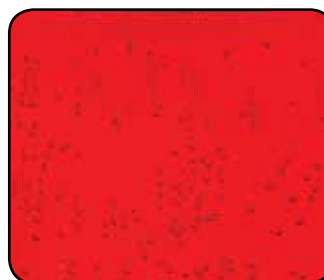
RED for Organic Acid Technology (OAT)

The TMC has established recommended colors for varying types of coolants (RP-351). While these are recommendations, the colors are not required and some manufacturers do not follow the color guidelines. The color recommendations are: