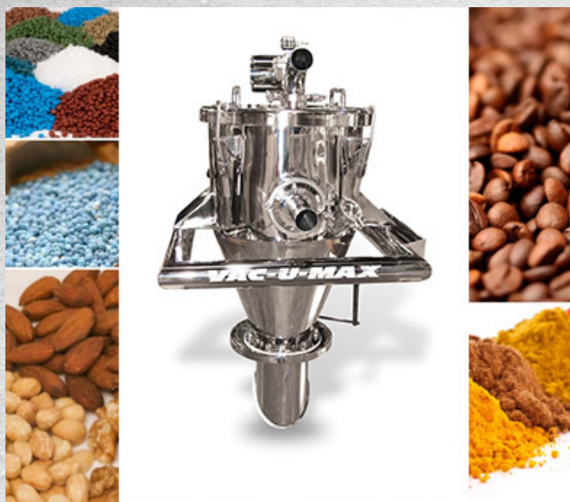
VAC-U-MAX MDL105017 Sanitary Vacuum Receiver for fine powders and granules conveys up to 4,000 lb/hr.

Beyond a material's bulk density, an understanding of how particular substance will behave under certain conditions is essential when designing a vacuum transfer system. Most often customers know whether their particular material is free flowing, sluggish or non-free flowing, important data to relay to the conveying manufacturer. It is not uncommon for there to be several product grades within the same product group and each one behave differently than the other. One grade of Zinc Oxide may have the consistency of talc, while another might be more cohesive and adhere to inside surfaces of conveying tubes. Some materials, in fact, can behave differently from one day to the next, affected by environmental elements.