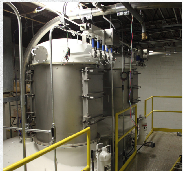
VAC-U-MAX Pulse Dome Filter Covers above VAC-U-MAX Vacuum Receivers equipped with side access doors

Just as cooking at higher elevation requires alterations, altitude also affects vacuum source sizing. For instance, a factory at the Jersey shore (sea level) might use a 5HP Vacuum pump for an application, but the same application in Denver, CO (one-mile above sea level) where air density is lower will require a 7.5 HP vacuum pump.