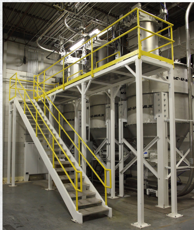
These 300-cu-ft material receivers are part of a pneumatic conveying system that transfers powders in a large-scale candy making process.

Bulk density, while one of the most important factors in sizing a system, is not the sole criterion used to determine components. Another important factor in sizing and determining the type of system needed to convey bulk solids is the distance material is traveling. In pneumatic conveying the more tubing you put in the system, or the further the conveying distance, the bigger your vacuum pump gets because it takes more airflow to pull (or push) the air through the tube.