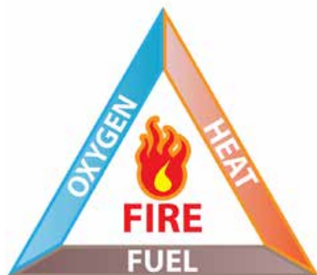
The “fire triangle” shows the three elements needed for a fire to occur: oxygen, heat and a fuel source.

storage tanks are electrically grounded, static charges can always occur. And the very material the tank holds can itself act as