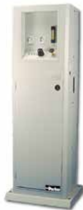
Membrane nitrogen generators use a separation technology made up of polymer fibers that act like a membrane.

ing liquid nitrogen are typically between 3000 gallon and 11,000 gallon in size. The cost of nitrogen to the end user depends on so-called "vaporization units" that relate to how much of the gas a company purchases annually. As of this writing, gas costs range from $0.30 to $0.70 per 100 cubic feet. Dewars are high-pressure tanks that hold between 3600 cubic feet to 4000 cubic feet of gas. The average cost to the user here is $0.80 to $0.90 per 100 cubic foot.