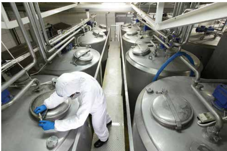
Large tanks such as these are used to store chemicals such as methanol, acetone and benzene and foodstuffs like wine and edible oils.

Maintaining the nitrogen blanket or “pad”