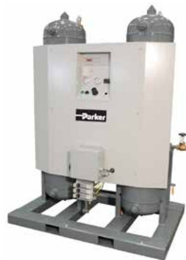
Pressure Swing Adsorption (PSA) nitrogen generators use a Carbon Molecular Sieve (CMS) material inside a vessel that contains pressurized air to draw off the nitrogen molecules.

As an example of how membrane nitrogen generators work, the Parker Balston membrane nitrogen generators use a proprietary hollow fiber membrane technology that separates the compressed air into two streams. One stream is 95% to 99% or higher pure nitrogen while the other stream contains the separated oxygen, carbon dioxide, water vapor and other gases. The generator separates the compressed air into component gasses by passing the air through semipermeable membranes consisting of bundles of hollow fibers.