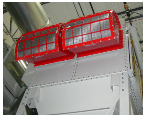
Figure 3: Flameless venting device