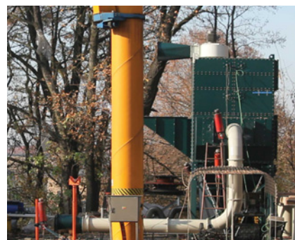
At the startup of a staged explosion, explosive dust is injected into the dust collector to create a flammable cloud.

NFPA 69 – Standard on Explosion Prevention Systems: This standard covers explosion protection of dust collectors when venting is not possible. It covers the following methods for prevention of deflagration explosions: control of oxidant concentration, control of combustible concentration, explosion suppression, deflagration pressure containment, and spark extinguishing systems.