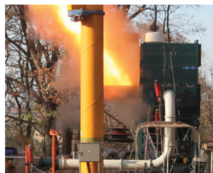
The flame is almost immediately diverted away from the dust collector to a safe area.