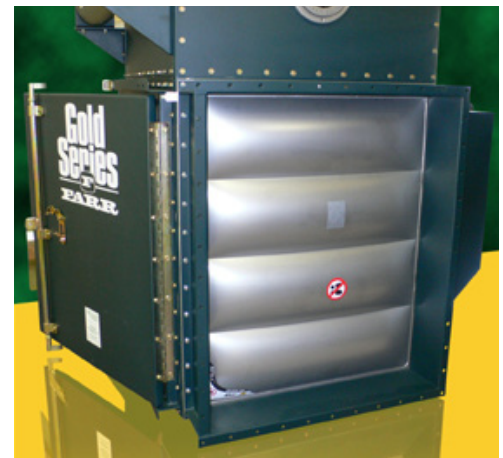
Figure 2: A dust collector explosion vent designed in accordance with NFPA standards.