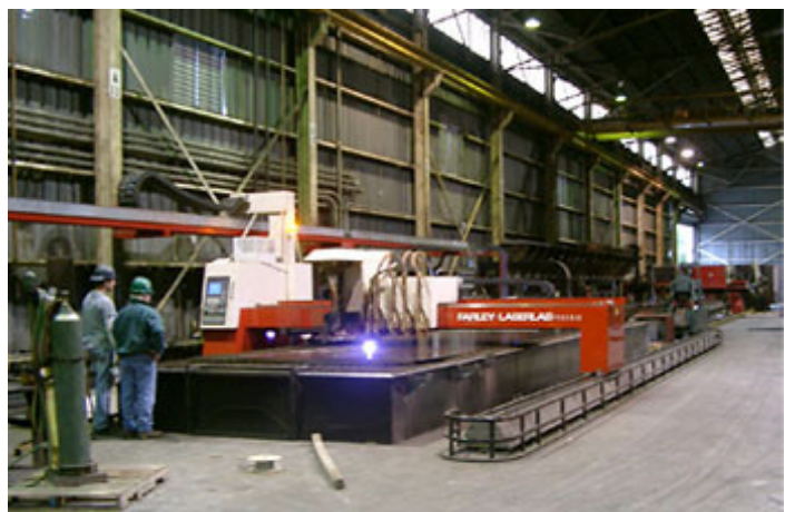
Photos of a factory taken before and after installation of a dust collection system show how effectively the collector cleans up hazardous dust and fumes.