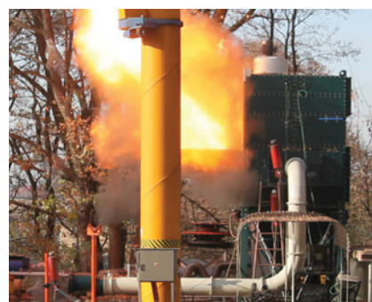
About 5 milliseconds later, the dust ignites and the vent opens.