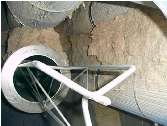
Figure 4: Example of horizontally-mounted dust collector filters

can go unnoticed for quite some time while fine combustible dust is blown into your facility. Vertically-mounted filters use baffle systems to segregate much of the dust into the hopper, which reduces the load on the filters and helps eliminate these problems.