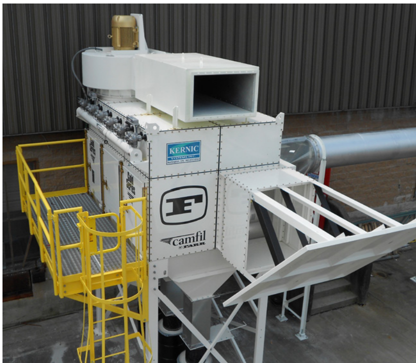
This dust collector is equipped with an explosion vent with vertical upblast deflector plate. Other safety features include a sprinkler system and filters with special carbon-impregnated media for static dissipation.

OSHA: It is OSHA's role, together with local authorities, to enforce the standards published by NFPA. In