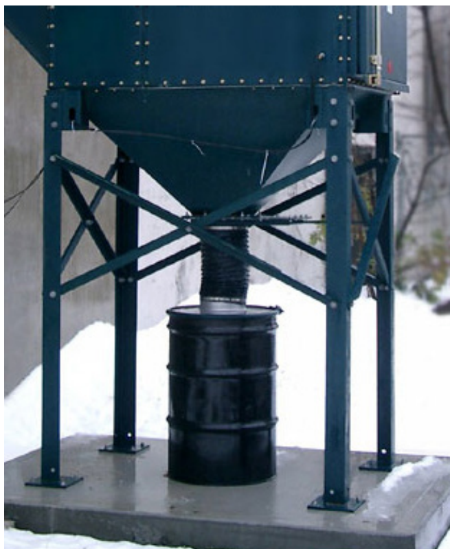
Storage drum prevents dust from backing up in the hopper and creating an explosion hazard.

The error of over-specification: The problems described above involve not doing enough in one way or another. But sometimes plant engineers err on the side of doing too much – the error of over-engineering or over-specification, which results in explosion protection solutions that may be needlessly expensive and time-consuming to maintain and monitor.