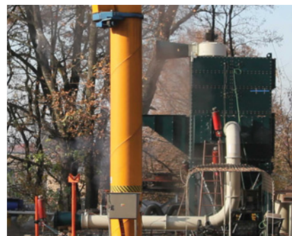
The smoke quickly clears. The whole event took about 150 milliseconds.