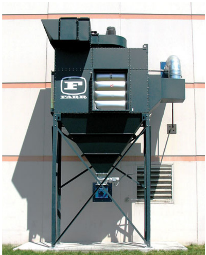
This heavy duty dust collector with explosion vent is designed to survive a combustible dust explosion with minimal damage.