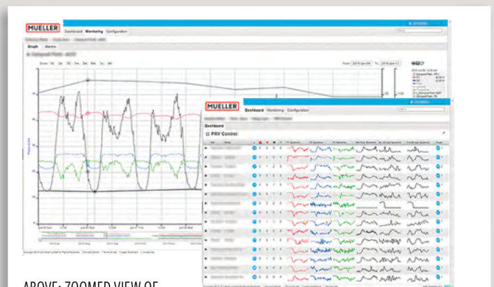
ABOVE: ZOOMED VIEW OF A SINGLE LOCATION SHOWING MULTIPLE PARAMETERS BELOW: SPARKLINE VIEW OF ALL PARAMETERS AT ALL LOCATIONS AT A GLANCE

When an alarm is raised the decaying process is triggered, with data delivered at the intervals shown above. When the alarm is cleared the decay process is canceled. Data is delivered at this point and then 2 hours later for post-event analysis.