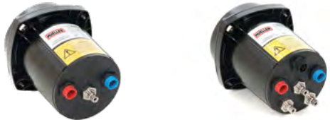
MUELLER LOGGERS CAN BE USED TO MONITOR PRESSURE AND FLOW AT ANY POINT OF INTEREST IN THE NETWORK.