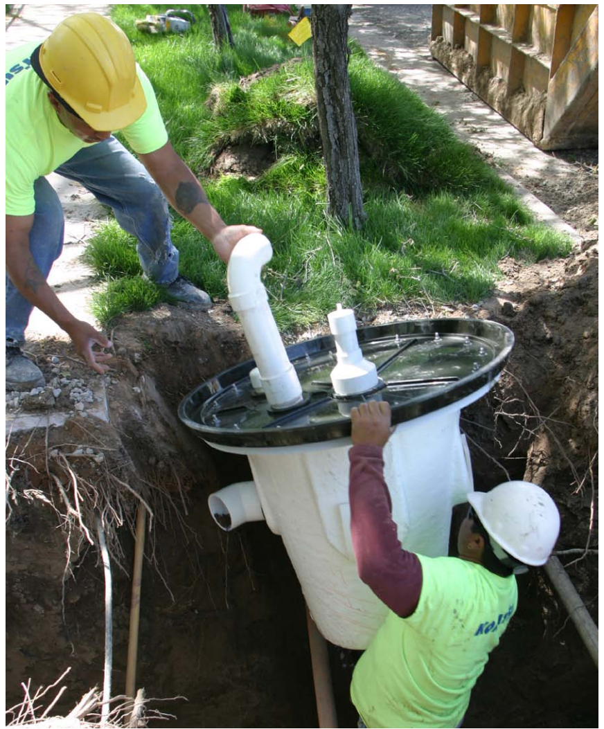
Hooper's vacuum sewer system, including valve pit sumps (shown here) was installed amid existing utilities with no disruption of service or inconvenience to residents.

"The projected cost of a gravity system led us to consider other alternatives," said Allen. "One of the systems we considered was vacuum technology. At the time it was something we were unfamiliar with. The more we studied it, the more we realized