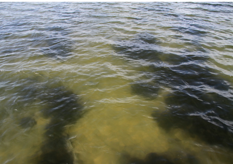
Macroalgae, sometimes referred to as seaweed, may contain toxic compounds that are suspected in the death of manatees in recent years.

plant life. His research has taken him from the Keys to the Florida gulf coast to the IRL and all around the Caribbean region. In 2011 he began looking through the keyhole at the Indian River Lagoon. The basis of his research in the IRL was rooted in nutrient science he developed in the Florida Keys back in the 80s.