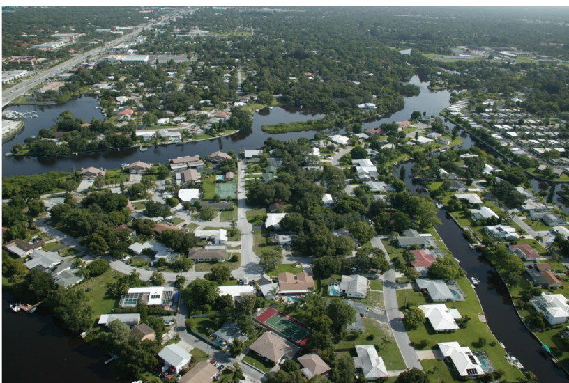
Sarasota County public works officials addressed the problem of septic tanks in the Phillippi Creek area several years ago and have since seen seagrasses recover and water quality improve.