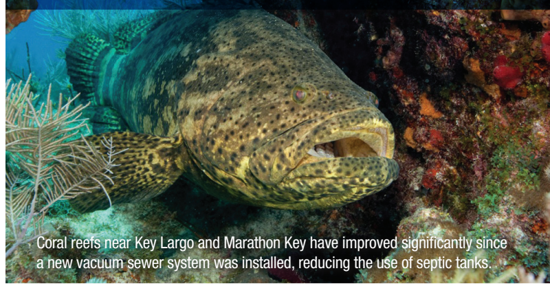
Coral reefs near Key Largo and Marathon Key have improved significantly since a new vacuum sewer system was installed, reducing the use of septic tanks.

I live in Port Largo, a subdivision of Key Largo, which happens to have very deep and wide canals. I noticed an almost immediate difference in water clarity within six months of the completion of the sewer system in our community. I wasn’t necessarily surprised, because I was aware of septic tank tests where they flushed color dye into the system and within the hour you would see it percolating out through the bedrock and into the canals. Switching from septic tanks to a modern sewer system made an obvious and almost immediate impact on the local marine environment.